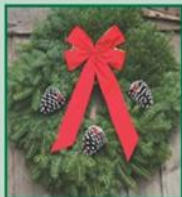
Classic Wreath $52.00