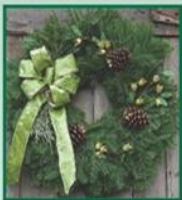
Wintergreen Wreath $57.00