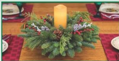
Ciana Centerpiece $55.00