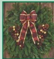
Santa's Sleigh Bells Wreath $61.00