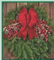
Elfin Delight Wreath $61.00