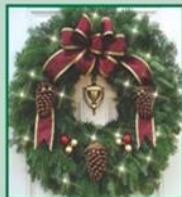
Victorian Wreath $56.00