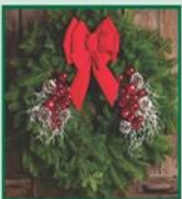
Winter Woods Wreath $61.00