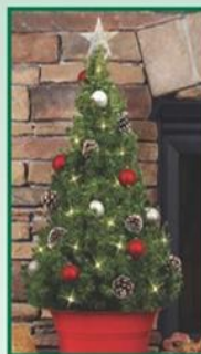
Living Christmas Tree $70.00