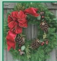
Cranberry Splash Wreath $57.00