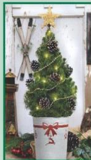
Table Top Tree $55.00