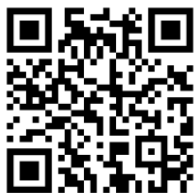
This QR Code takes you straight to our Giving Page

Your donations will support the 2024 Music Ministry Tour & Pilgrimage and help to cover the cost of fundraising, as well as tour and travel expenses. Any remaining funds will support the music ministry in endeavors that may incur expenses beyond what the Music Ministry's regular budget can support. Examples would be tours, pilgrimages, performance opportunities that may have a fee, or expenses involved with traveling to sing at other venues/churches. When donating, be sure to add the memo – for Choir Pilgrimage Tour. Thank you!