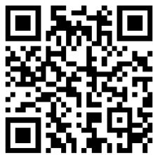
This QR Code takes you straight to our Giving Page

Do you find God in nature? The goals of the Spirituality in Nature Groups are to explore nature to better understand what it means to be stewards of God's creation, and to strengthen our connection with the amazing natural world around us. For our next event, join us at the bird ponds at Ventura Harbor (corner of Spinnaker and Angler) for an easy loop walk while we watch the variety of birds who call the area home. Bring binoculars if you have them!